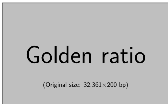
Figure 1: A figure with a caption that runs for more than one line. Example image is usually available through the mwe package without even mentioning it in the preamble.

an appropriate point within the text. The graphicx package supports various optional arguments to control the appearance of the figure. You must include it explicitly in the L A T E X preamble (after the \documentclass declaration and before \begin{document} ) using \usepackage{graphicx} .